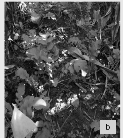
Annual ryegrass (a) and Tillage Radish® (b) interseeded in corn in June. Photos taken in October.